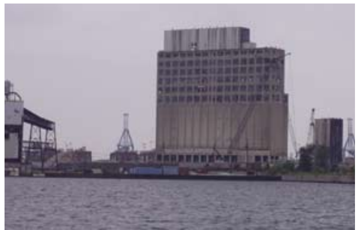
We can all do our part to protect the Baltimore Harbor watershed.

So clean up your street; urban runoff can be just as damaging to the harbor as sewage. Picking up after yourself and your dog will not only make your neighbors happy, but it will make the critters that depend on the Harbor water for survival even happier.