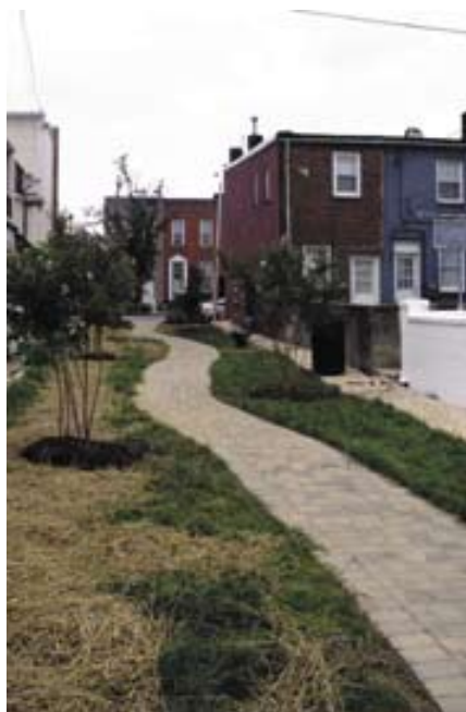
Two Rivers Park after the completion of Phase I work.

Be sure to take some time to stroll through this little gem of a park, and when you do, remember that everything you're looking at was put there by a member of your community. Thanks to everyone who participated – we can all be proud of the results!