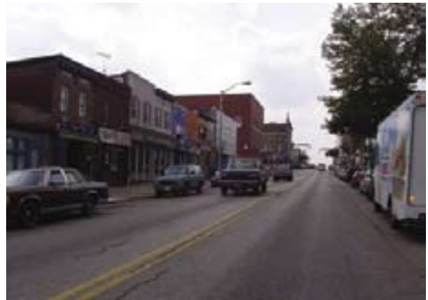
Business is booming in Highlandtown.

High Grounds: 3201 Eastern Avenue in Highlandtown, across from the Creative Alliance, (410) 342-7611, missionroaster@yahoo.com.